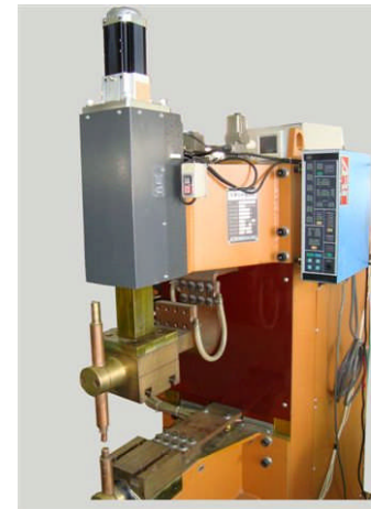
Stationary Spot Welder